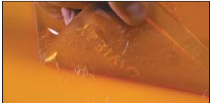
Traditional Adhesive System

Visit www.3m.com/flexo for more information or contact your 3M representative.