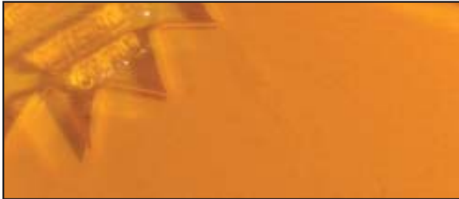
3M™ Thin Flexographic Mounting Tape 2205 (Enlarged view of plate mounted on carrier)

An exclusive crosshatched pattern in the liner creates a series of microchannels throughout both adhesive layers of the double-coated tape.