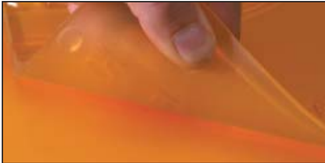
3M™ Thin Flexographic Mounting Tape 2205

2205 Tape provides clean removability from both plate and carrier, allowing for reuse of both.