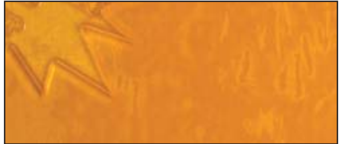
Traditional Liner (Enlarged view of plate mounted on carrier)